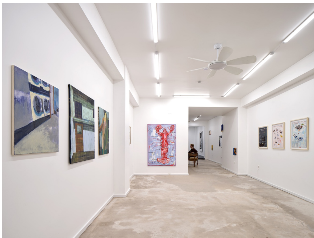
Exhibition view | Pit Riewer & Ugo Li | Group Show I Part I