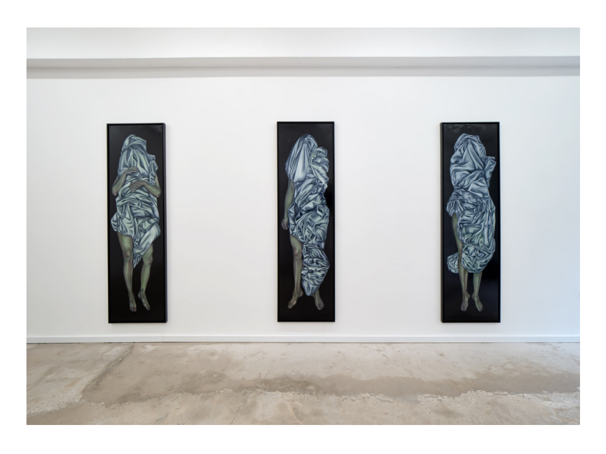
Exhibition view I Julie Wagener I Where is the light coming from