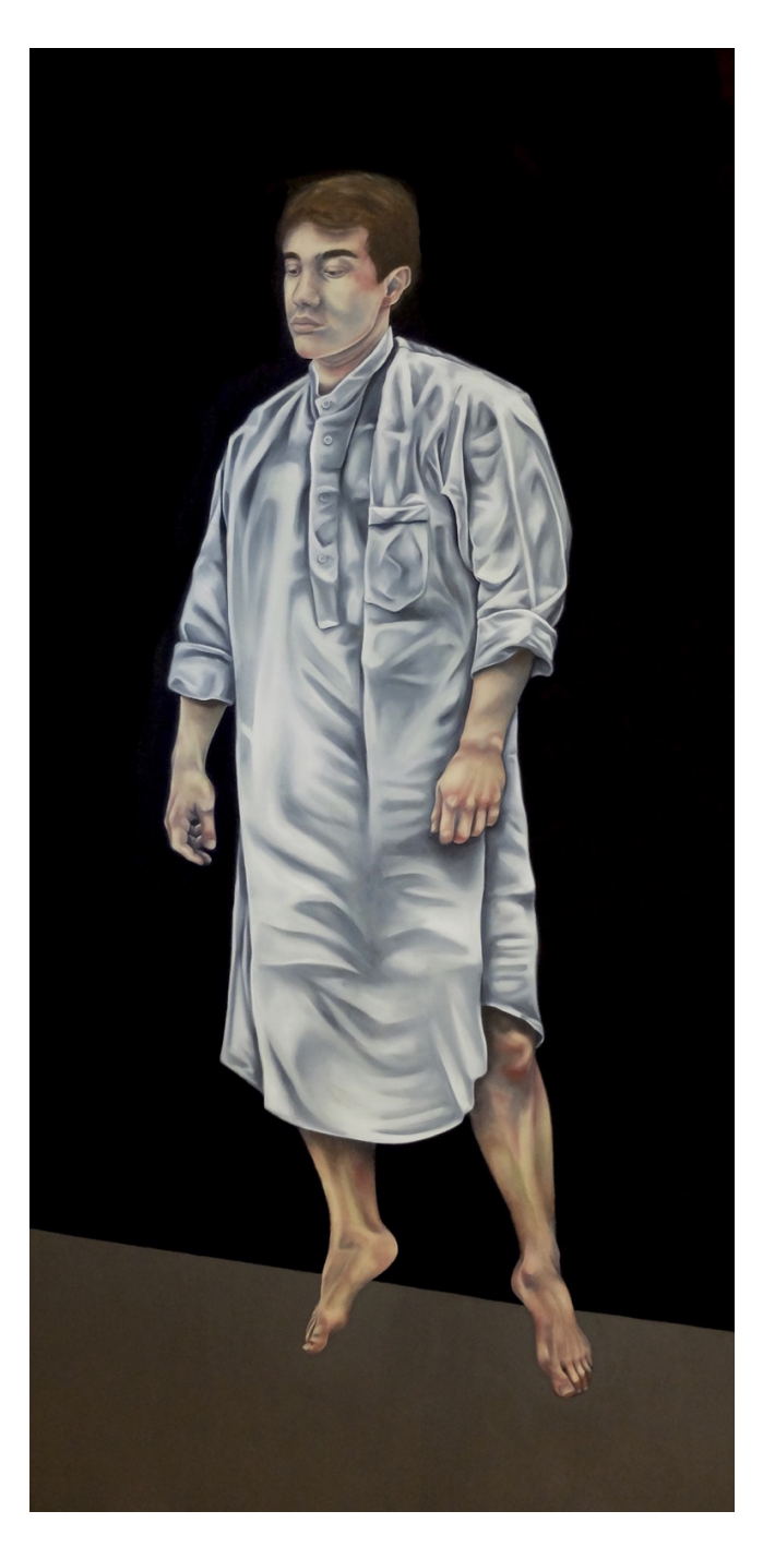
Julie Wagener I I Am Looking For You In The Woods Tonight I , 2022 Oil on wood 200 x 100 cm